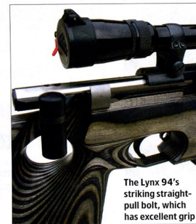
The Lynx 94's striking straight-pull bolt, which has excellent grip

Cartridge choice is as you would expect, with .22-250, .243, .308, 6.5x55 and .30-06 fitting the bill nicely and larger cartridges such as 9.3x62 and the new .375 Ruger all an option (.338 Lapua, .375 H&H and .416 Rigby available on the bolt-action XO and XXO only). As the rifle is handcrafted, there are other calibres available, and barrel reamers can be ordered to suit your requirements. The 6.5x47 Lapua has been with us for five years, and due to its higher operating pressure is similar to the old 6.5x55mm cartridge, but uses less powder. The barrels' blanks are sourced from Lothar