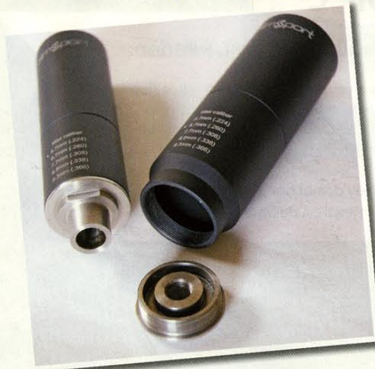
The beauty of the aimZonic system is that MM or Cyclone is the nuts as you can swap cans easily from one rifle to another

I should just like to point out at this juncture that the Cyclone should not be used on its own as it does not offer any true moderation effect. Out of enquiry I risked a single shot without ear defenders and it did spike, so forget that one. It's an add-on device that augments the effectiveness of the moderator at the front and nothing else! Legally only the front section is classed as a moderator so no certificate is required to buy either the back tube or nut.