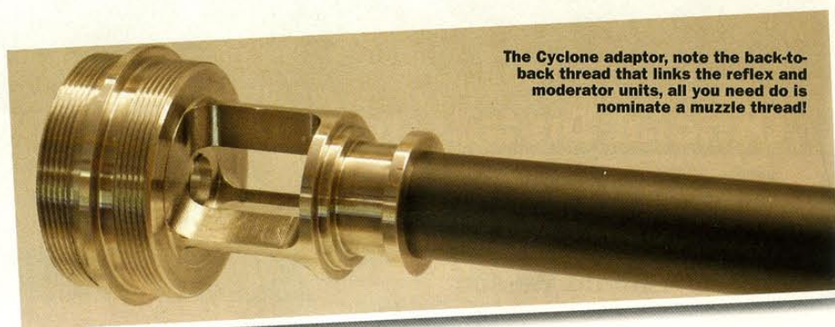
The Cyclone adaptor, note the back-to-back thread that links the reflex and moderator units, all you need do is nominate a muzzle thread!

The Cyclone rear unit consists of the reflex body assembly with a plastic barrel stabiliser, which needs to be bored out to suit the O/D and the stainless steel nut. The front section is cupped with the bullet exit hole and threaded to accept the Compact or