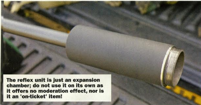
The reflex unit is just an expansion chamber; do not use it on its own as it offers no moderation effect, nor is it an 'on-ticket' item!