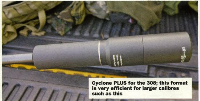
Cyclone PLUS for the 308; this format is very efficient for larger calibres such as this

PLUS moddy less its MM nut. Behind this are three tie bars (slots) that connect to the actual muzzle thread unit. In firing the gasses exit the slots and are diverted back into the expansion chamber with the moderator working in the normal way.